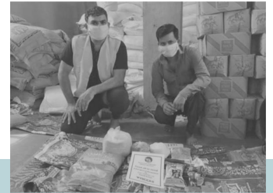
Free Food during COVID-19

The Company shares corporate benefits with the community and supports various causes that work towards the betterment of the less privileged sections of the society.