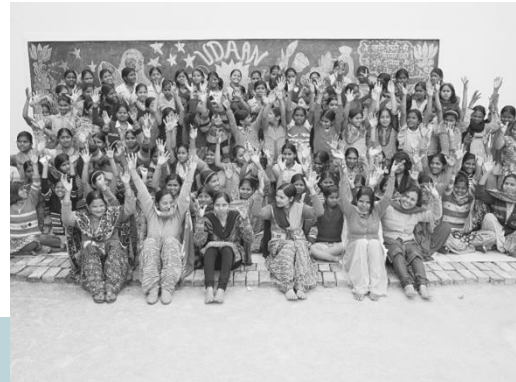
Udaan Project of CARE India