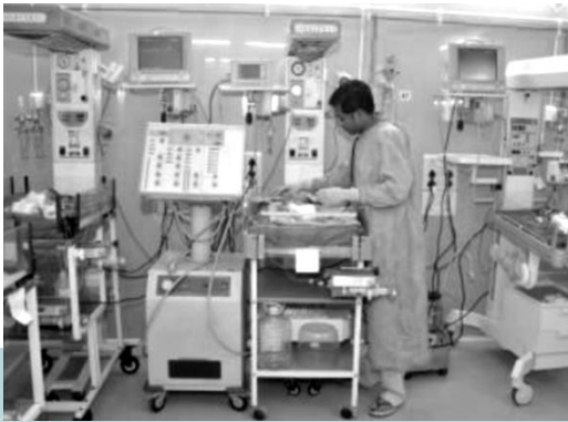
Shrimad Rajchandra Hospital

We work closely with various trusts to support eradication of hunger and poverty, education of girl child and the youth, women empowerment and medical aid to improve quality of life.