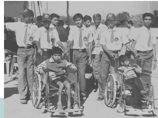
Schools at Sagrosana & Takarwada, Gujarat