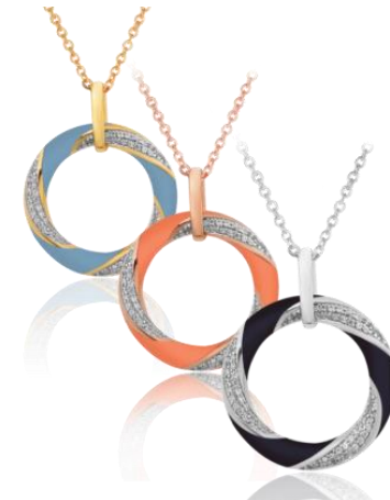
CERAMIC Fine Jewellery