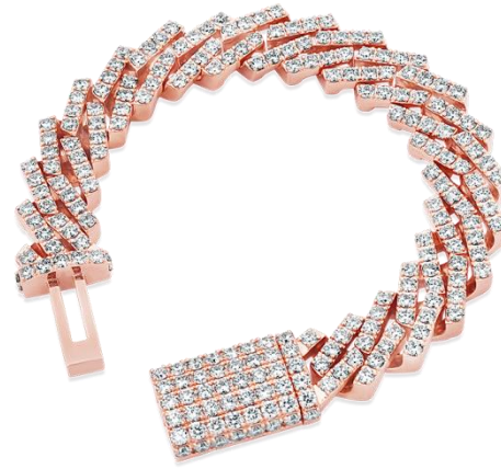
URBANE Men's Jewellery