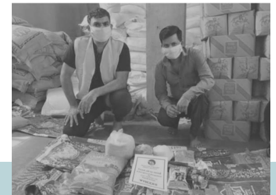
Free Food during COVID-19

The Company shares corporate benefits with the community and supports various causes that work towards the betterment of the less privileged sections of the society.