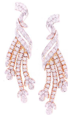
Stardust Earrings Gold Wt: 13.58 gms Diamond Wt: 2.09 cts