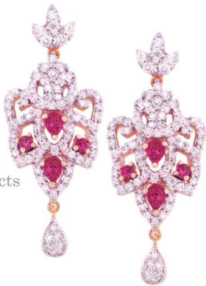
EVA Earrings Gold Wt: 11.32 gms Diamond Wt: 1.53 cts Colour Stone Wt: 1.17 cts

The 'Stardust' collection is inspired by Greek mythology. In ancient Greece and Rome, diamonds were believed to be splinters from falling stars. We captured these magical fragments and interlaced them to create enchanting necklaces. The collection is a celebration of celestial beauty.